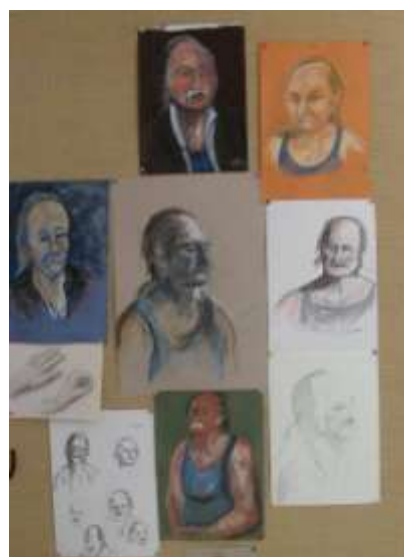
Portraiture 3 August