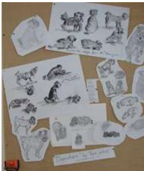
Paint Frankie the Dog 3 September