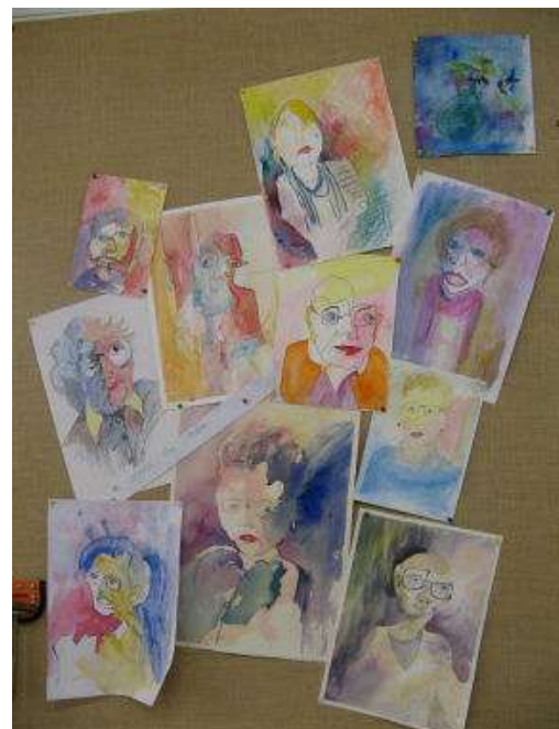
Portrait across the table 17 September