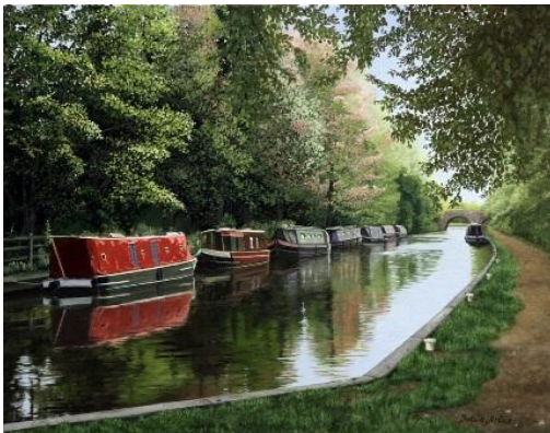
2012 Watery Wayside, Dulcie Artus