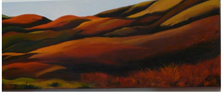
2009 Red Tussock of Onslow Helen Rowlands