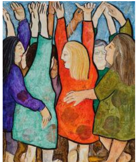
2011 Women Holding Up The Sky Janice Giles