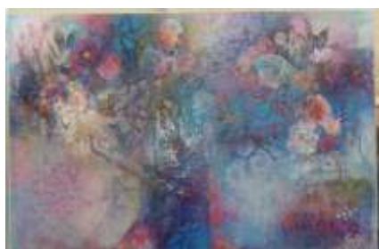
Jackie Gray - “Ten Tonne Terror”