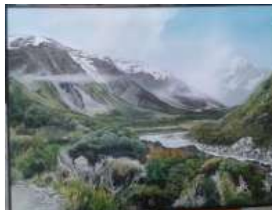
Graham Baker – “Hooker Valley Track to Mt. Cook”