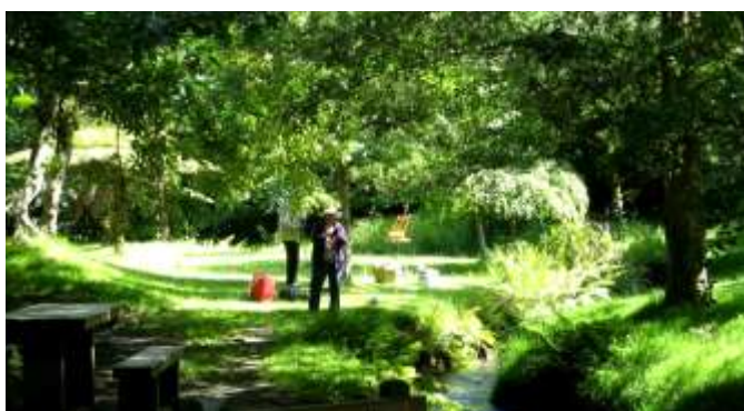
Tuesday morning artists at McLaren Falls in December 2015