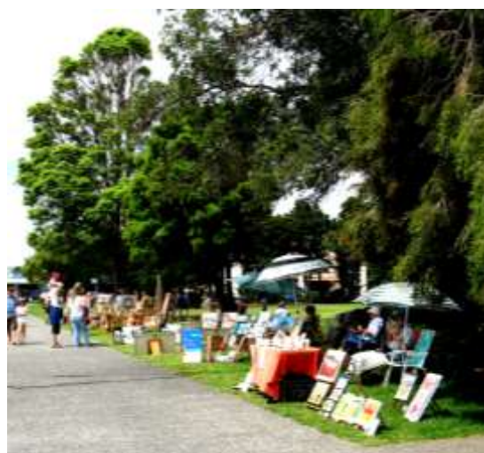
(Above and left) – Art in the Park Saturday 16 January 2016